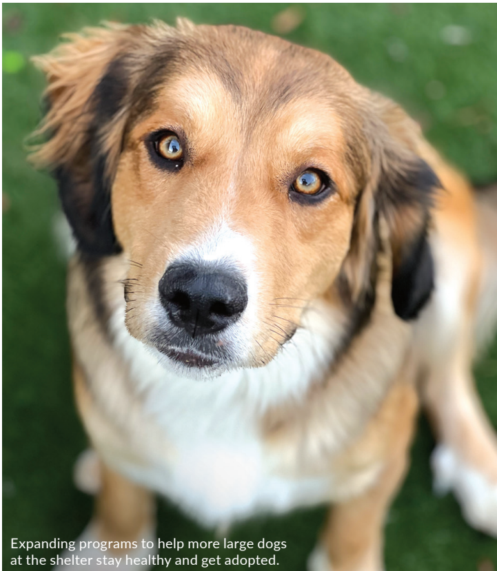
Expanding programs to help more large dogs at the shelter stay healthy and get adopted.

We started a campaign to win him the title. Both local and Bay Area media partners (and even businesses), joined in on the fun - it felt like all of Sacramento was pulling for him to win! While Bark did ultimately come in second place in the competition, his popularity helped other animals in need. We planned an adoption special in his honor and 23 dogs found new homes, including several longtime residents! Supporters from all over Sacramento tuned in to the Puppy Bowl and Bark was the FIRST dog featured during the game! We are thrilled that this little QuarterBARK helped spotlight Sacramento and helped other animals find their forever homes!