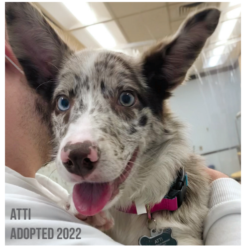
ATTI ADOPTED 2022