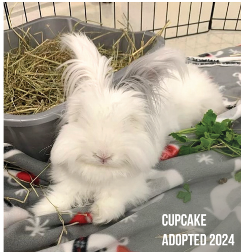
CUPCAKE ADOPTED 2024