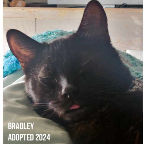
BRADLEY ADOPTED 2024

We adopted Tinkerbelle two years ago. She brings so much joy in our little family. She is the only dog we saw and we were determined to take her home that day. Tinker has been in so many places with us. She absolutely loves her car rides. She has been in the snow, she has been in Truckee and enjoyed the cabin life and the scenic drive along the Donner Lake. Tinker loves to go on a small walk at Sutter's Fort as well. Adopting Tinkerbelle is the best decision our family ever made and she completes our family of three. She is the daughter we never had. Tinkerbelle is living her best glam only daughter life.