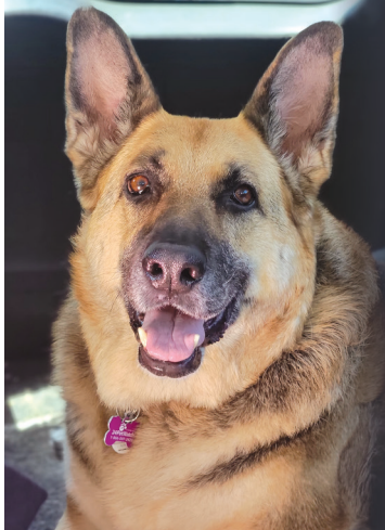
TINKERBELL, ADOPTED 2022

We will feature some top photos based on quality in Heartbeats and on our social media pages.